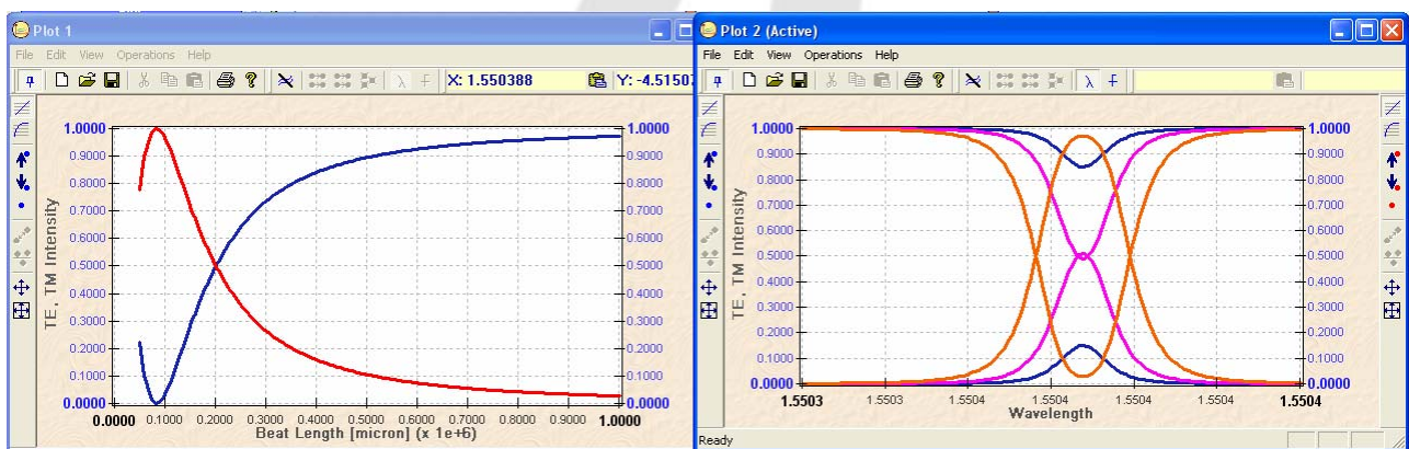
Fig. 2 – Left: TE and TM output intensity at resonance vs the beat length parameter; Right: TE and TM transfer function for different coupling between TE and TM.

If a small polarization conversion in the bent sections of the ring occurs, the transfer function is affected and an output TM mode is generated. To study this effect, the ‘TE/TM coupling’ in the bend properties panel must be enabled and the Beat length parameter set to bL . The beat length defines the polarization coupling: with the value already set in the Variable Table ( bL=8.3 \cdot 10^4 \mu\text{m} ) a total polarization conversion occurs at the resonant wavelengths. Fig. 2 shows the TE and TM output intensities for various values of bL . The left figure is generated by scanning the beat length ( bL ) from 1e6 to 5e4 at the resonant wavelength \lambda=1550.388 \text{ nm} . Note that even for a very low conversion ( bL=1e6 ) the TM generated at resonance is noticeable and that for bL=8.3e4 the conversion is complete. In the right graph the TE and TM intensity transfer functions for three values of bL are reported ( bL=5 ; 2.4 and 1.2 times 8.3e4 ). As bL reduces the conversion increases until a total conversion occurs. In Fig. 3 it is shown how an input TE mode is completely converted to an output TM mode near the ring resonance for bL=8.3e4 . Note also the second order transfer function, despite a single cavity is used. Further, the user can readily test that the TE and TM group delay characteristics are identical; that the intensity enhanced is reduced because of the coupling widens the bandwidth ( I_e=11 ); the effect of the waveguide attenuation and so on.